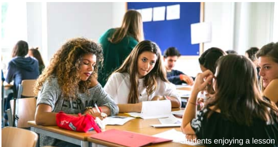
Students enjoying a lesson

We require our teachers to have a degree plus a TEFL certificate, for example, CELTA or Trinity Cert. TESOL. Our teaching team are responsible for planning and delivering communicative lessons which enable students to use and develop their English in an international classroom. Teachers are supervised by an Academic Manager who provides academic support and ensures the programme is delivered to the highest possible standard. We also pride ourselves in our teacher development programme of workshops and lesson observations provided throughout the summer.