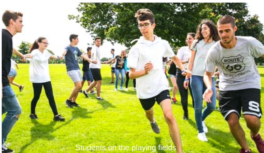
Students on the playing fields

We run "Core Activities" which gives students the opportunity to do a pre-arranged activity for half the session in an internationalized group, then for the other half they can choose an activity of their choice with their friends.