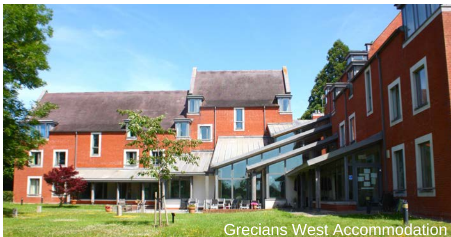
Grecians West Accommodation

The houses are all quite similar in design offering a mixture of shared rooms and singles, with shower blocks on every corridor. Disabled access rooms are available. Rooms sleep from 1 to 4, with single rooms for group leaders. There are spacious social areas available in every boarding house. The sixth form accommodation (Grecians) is more modern and all rooms are single with a sink in each room. Bedding is provided but students need to bring their own towels. The accommodation is a few minutes' walk from the dining hall and classrooms.