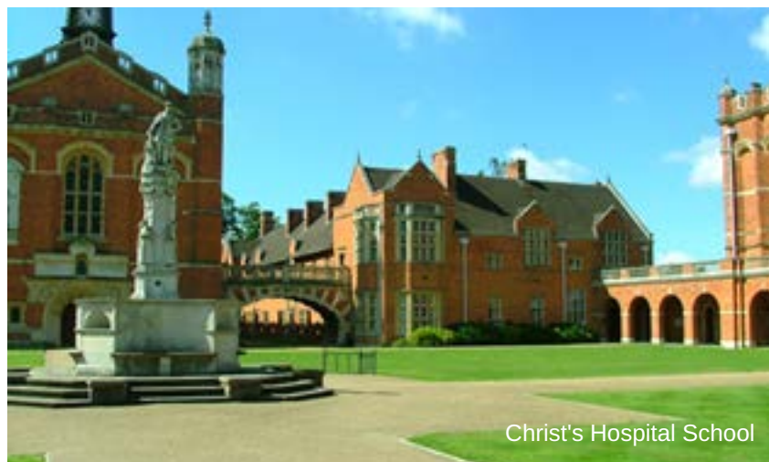
Christ's Hospital School

The school also boasts a stunning theatre modelled on Shakespeare's Globe Theatre. The school offers a wealth of excellent, modern facilities including spacious classrooms, a large sports centre, an indoor swimming pool, Astroturf sports pitch and numerous playing fields. There is a railway station in the village offering easy access to London, Brighton and other destinations.