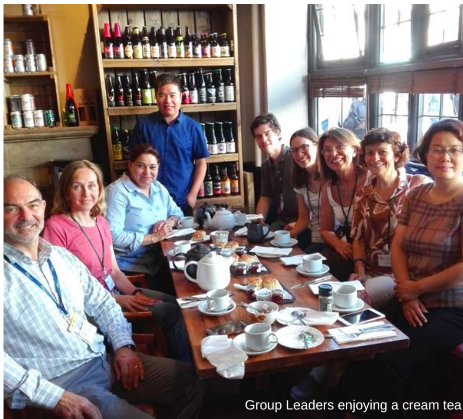
Group Leaders enjoying a cream tea

Elac has a dedicated office and its location will be given out when students arrive. There is also a Group Leaders room on-site where Group Leaders can relax and have access to tea and coffee.