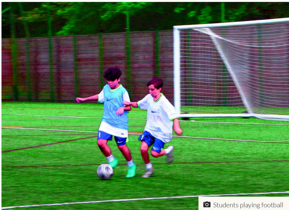
Students playing football