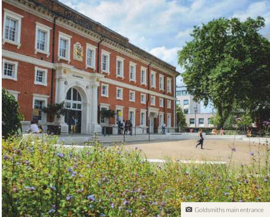
📷 Goldsmiths main entrance

1 All students must be born before 1/1/2011