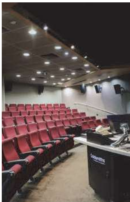
📷 Teaching facilities