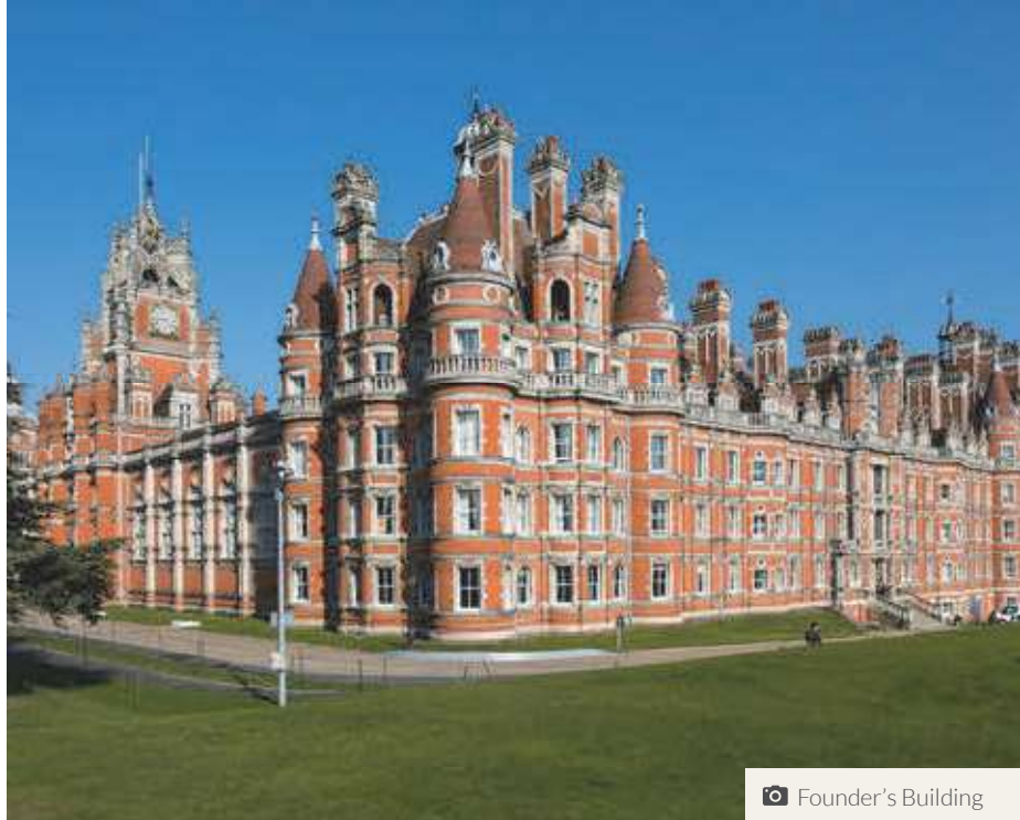
📷 Founder's Building