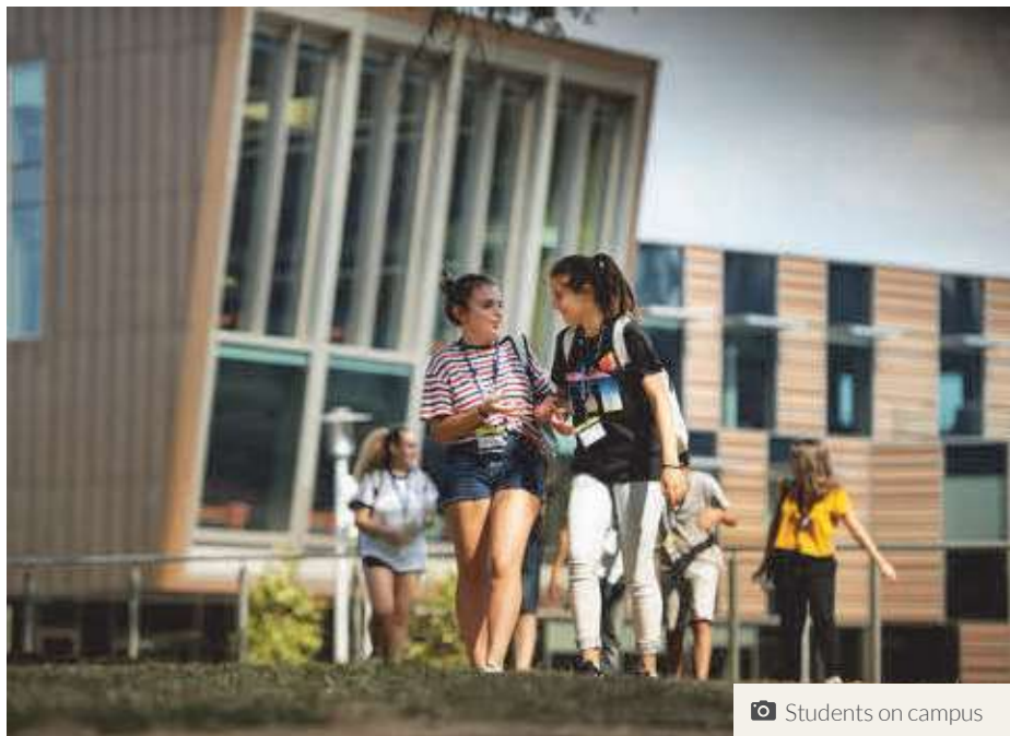
📷 Students on campus