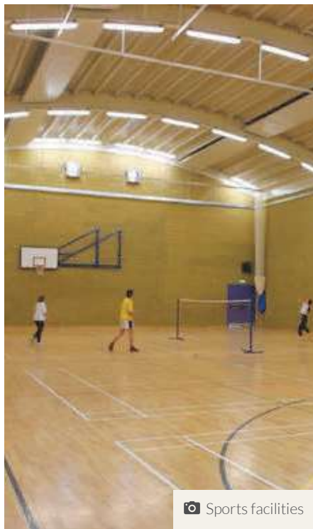
📷 Sports facilities