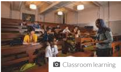
📷 Classroom learning