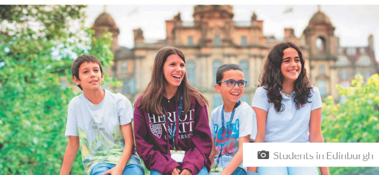
Students in Edinburgh