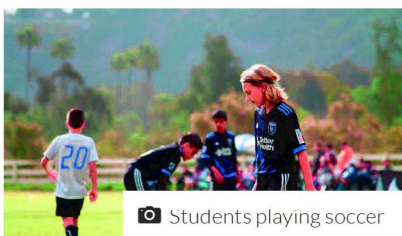
Students playing soccer