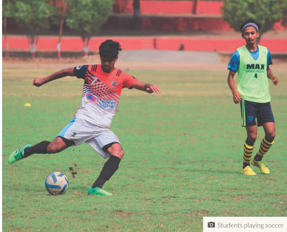
📷 Students playing soccer

Note: The Kean University name is strictly for the purpose of identifying the location at which Oxford International Junior Programmes are delivering the programme. Oxford International Junior Programmes have no affiliation with the Kean University and is not involved in or responsible for the quality, suitability, delivery or other aspects of Oxford International Junior Programmes in any way.