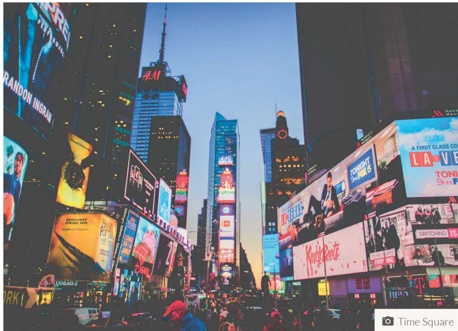
📷 Time Square