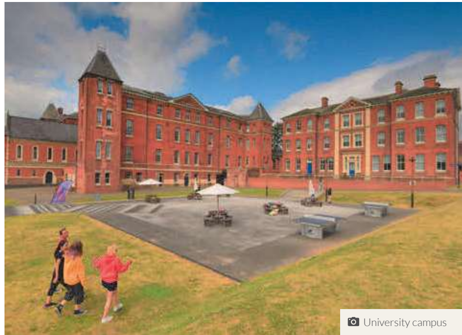
📷 University campus