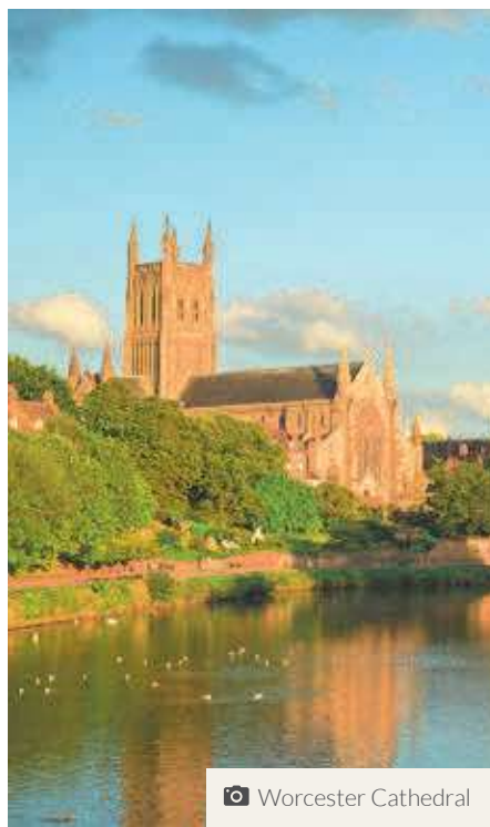
📷 Worcester Cathedral