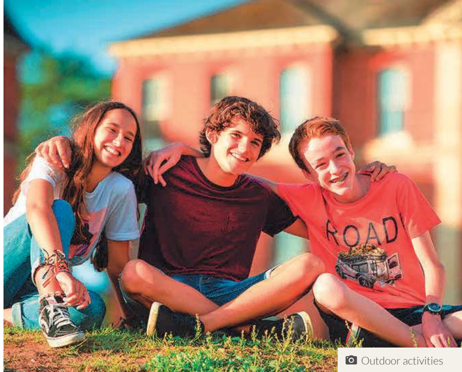
📷 Outdoor activities

** (Supplements and minimum numbers may apply)